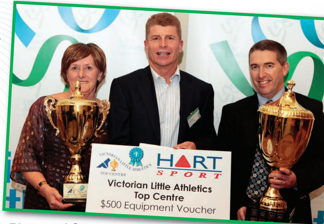
Ringwood Centre Winner 2009/10