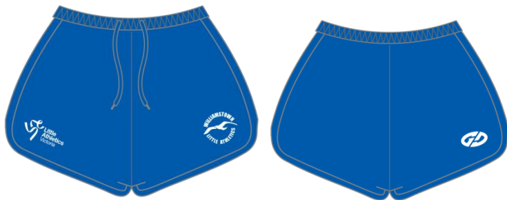
Running shorts Front Back